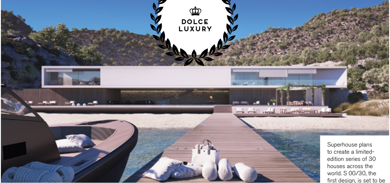
Superhouse plans to create a limited-edition series of 30 houses across the world. S 00/30, the first design, is set to be built on an undisclosed Mediterranean island