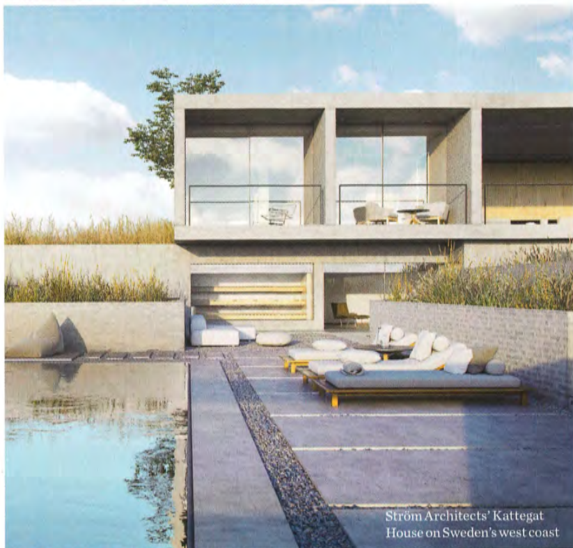
Ström Architects' Kattegat House on Sweden's west coast